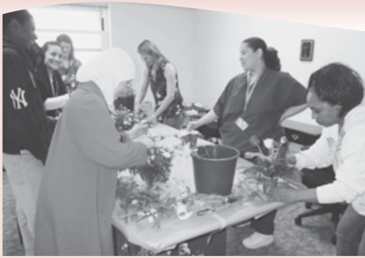
Relaxing with horticultural therapy